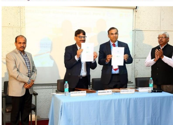
Bengaluru. ITI Limited yesterday signed a MoU with India Electronics & Semiconductor Association (IESA) to provide its infrastructure to manufacture electronic products with special focus on telecom and allied smart electronic products.

ITI Limited signs MoU with India Electronics and Semiconductor Association